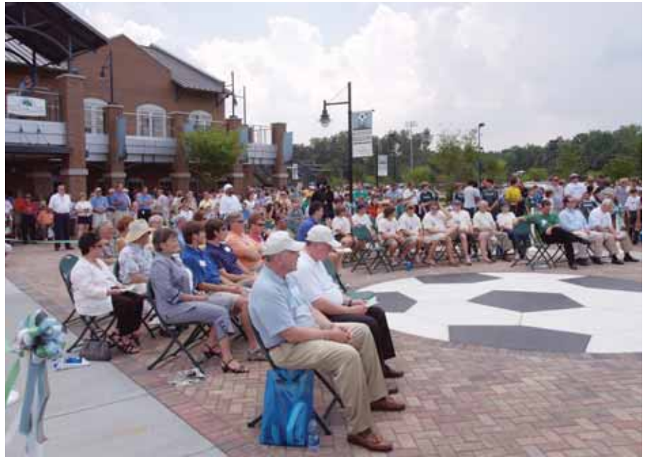
The Grand Opening of Manchester Meadows on June 11.

Manchester Meadows is located at 337 E. Mount Gallant Road and, in addition to its eight soccer fields, the park includes playgrounds, a lake pavilion, a soccer pavilion and walking trails. The park is